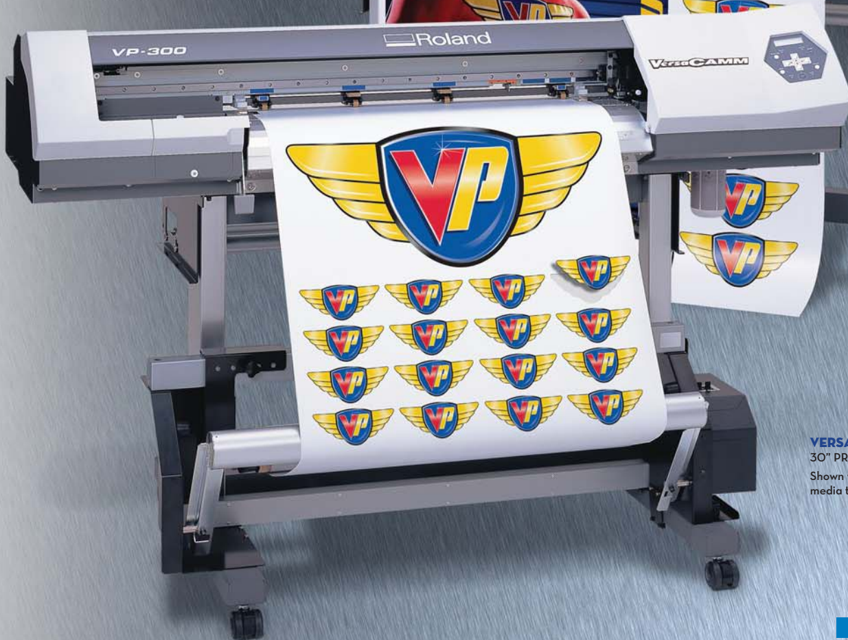
VERSACAMM VP-300 30" PRINTER/CUTTER Shown with optional heavy-duty media take-up system.