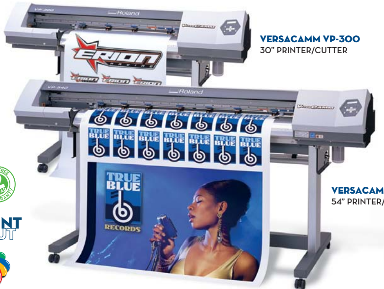
VERSACAMM VP-300 30" PRINTER/CUTTER